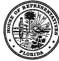
LARRY CRETUL Speaker of the House of Representatives