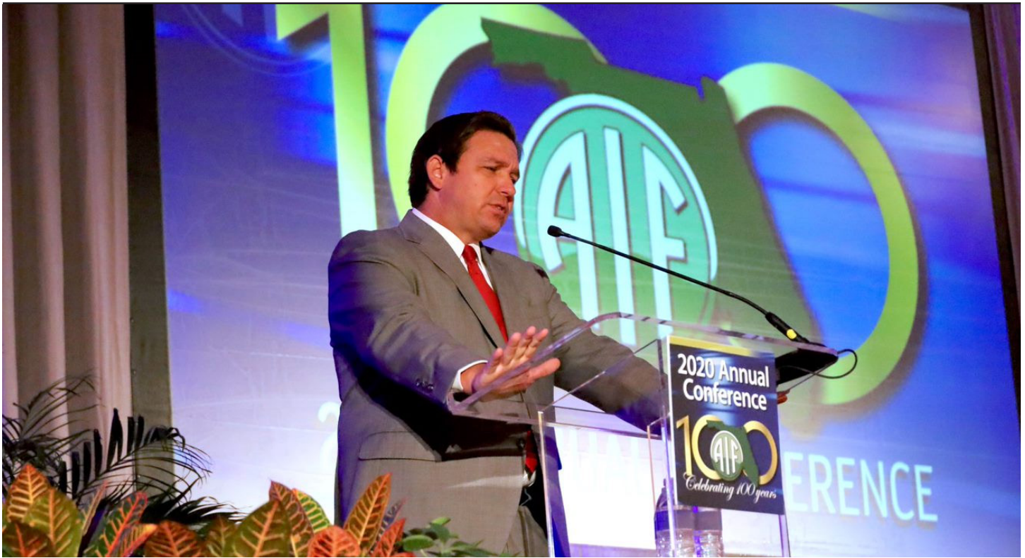
Governor Ron DeSantis addresses members at AIF's Annual Conference.