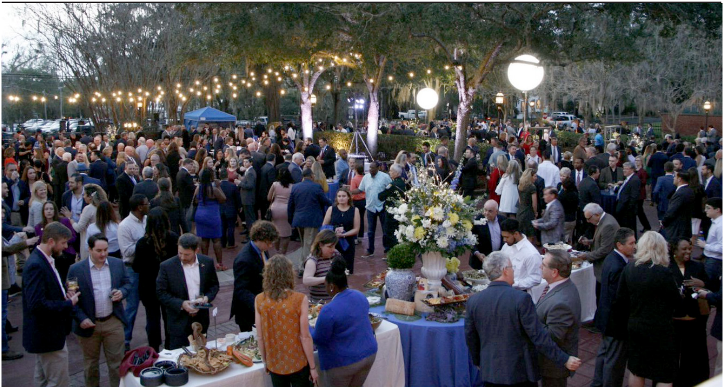
AIF members and guests enjoy a beautiful evening at AIF's Legislative Reception.