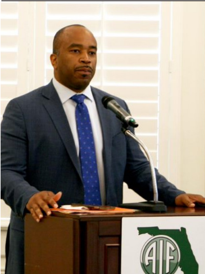
Senator Bobby Powell (D-West Palm Beach) speaks with members at AIF's Session Briefing in Tallahassee.

research. These procedures and protocols allow for the use of the safest, most appropriate, and most cost-effective drugs and permit progressing, to other more costly drugs with more sophisticated interactions and side-effects in accordance with FDA approvals. However, several legislative proposals have been initiated to dismantle this rational, cost-effective, and care-improving protocol, which would force insurers and consumers to purchase the most expensive drugs and treatments even when equally effective therapies are available at much lower costs. The use of specialty pharmacies, drug formularies and cost-sharing incentives are examples of benefit designs that have helped and should be permitted to continue to help patients get the care they need while keeping their coverage affordable.