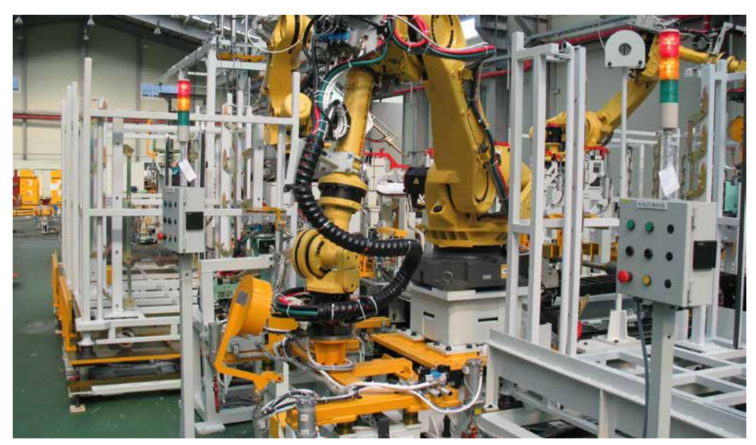
The removal of the three year sunset on the complete elimination of sales tax imposed on the purchase of manufacturing equipment and machinery will help to expand manufacturing here in Florida.

HB 817 died on the calendar in the Florida House chamber.