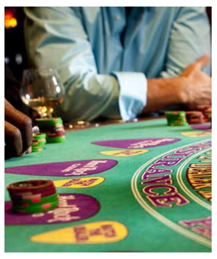
AIF has long supported the creation of high-end destination resorts to bring jobs and outside capital to the state.

HB 1233 died in its last committee stop in the House Appropriations Committee.