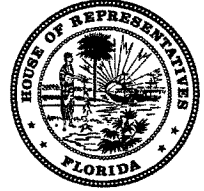
MARCO RUBIO Speaker of the House of Representatives