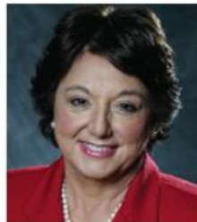
Senator Kathleen Passidomo