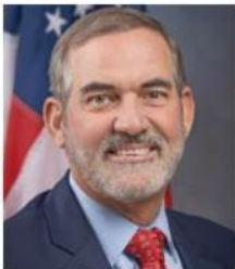
Senator Stan McClain