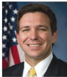
Governor Ron DeSantis