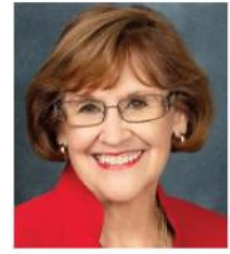
Senator Gayle Harrell