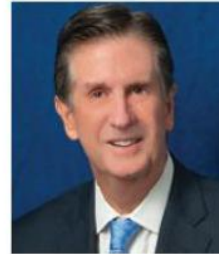
Senate Majority Leader Jim Boyd