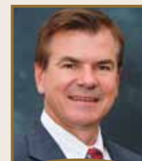
2010 CFB Winner

development and education reform policies. Rep. Weatherford sponsored a comprehensive jobs package ( HB 1509 ), which provides Florida's employers with numerous economic development incentives to promote much needed job growth. Furthermore, Rep. Weatherford's wide-ranging jobs bill will make Florida a more competitive state for commercial expansion, particularly within the film & entertainment industry. Rep. Weatherford is also to be commended as a strong champion of education reform. As the prime sponsor for the "Right Size Class Size" amendment ( HJR 7039 ), Rep. Weatherford advocated for giving Floridians the opportunity to repeal constitutional class size requirements that are inflexible and too costly to implement with an ever-increasing budget gap. Rep. Weatherford's capacity to work with members on both sides of the aisle and pass these measures has demonstrated his irrefutable ability to be an effective leader. AIF is proud to recognize Rep. Will Weatherford as a Champion for Business .