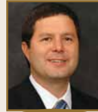
2010 CFB Winner