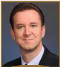
2010 CFB Winner