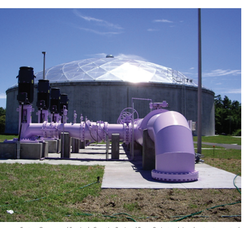
Eastern Orange and Seminole Counties Regional Reuse Project reclaimed water storage tank.

The growing scarcity of water supplies has already resulted in acrimonious and expensive litigation among local governments; water management district permit challenges; restrictions on new economic development; and in some areas, a continued decline in natural resources. Ultimately, an unstable water future will continue to wreak havoc on Florida's economy and environment.